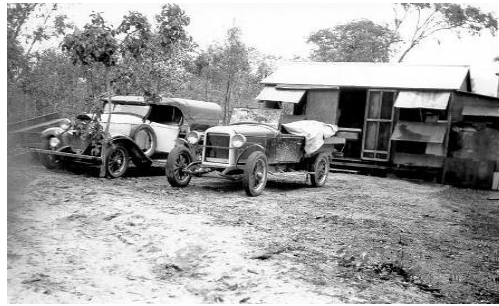
96A Whippet & Essex cars, Marlin Street, Balgal Beach Ca1946

You can also visit The Thuringowa Collection at the CitiLibraries Townsville website, where you will discover books, pictures, oral histories and ephemeral materials for you to enjoy or help you with your research.