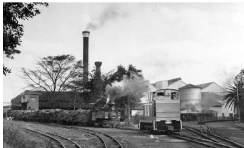
Old and new locomotives in the Morton Sugar Mill yard, Nabour, 1963

Sunshine Coast Libraries in Queensland has been a contributor to the Picture Australia collection at the National Library of Australia since 2003.