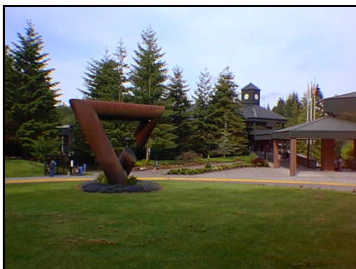
The main campus is nestled in a beautiful wooded area, a few minutes away from the state capitol in Olympia, Washington.

Visit today at: http://www.library.spscc.ctc.edu/